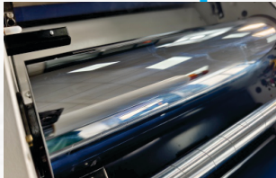
High Precision Mirror Roller