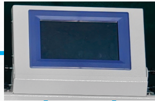
High Brush LCD Display