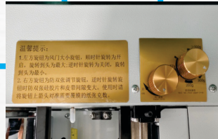
Anti Double Feeding Adjust