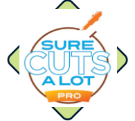
Sure Cuts A LOT (Scal)